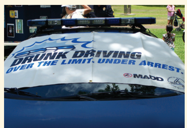
▲ Getting the message out on the new national DUI campaign

The goal of the project was to reduce motor vehicle injuries and deaths by decreasing the number of teens driving while under the influence of alcohol. Due to administrative problems, the program was not executable.