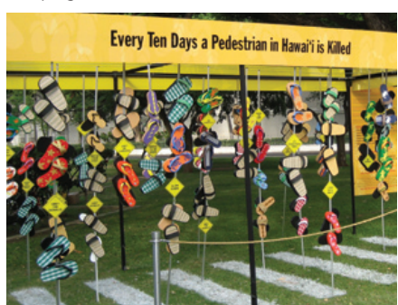
▲ Each pair of slipper represents a pedestrian fatality between 2001 and 2005

The Walk Wise Hawaii program gathers all of the pertinent stakeholders for pedestrian safety together to come up with ideas and programs that can make a difference in pedestrian safety. During federal fiscal year 2007, this program used a poignant "Slipper" display at various locations throughout the State to bring attention to the number of pedestrians who have died over the past five years. The program was also involved with the launching of the "Step to Safety with ASIMO" campaign, in which the Honda Motors robot