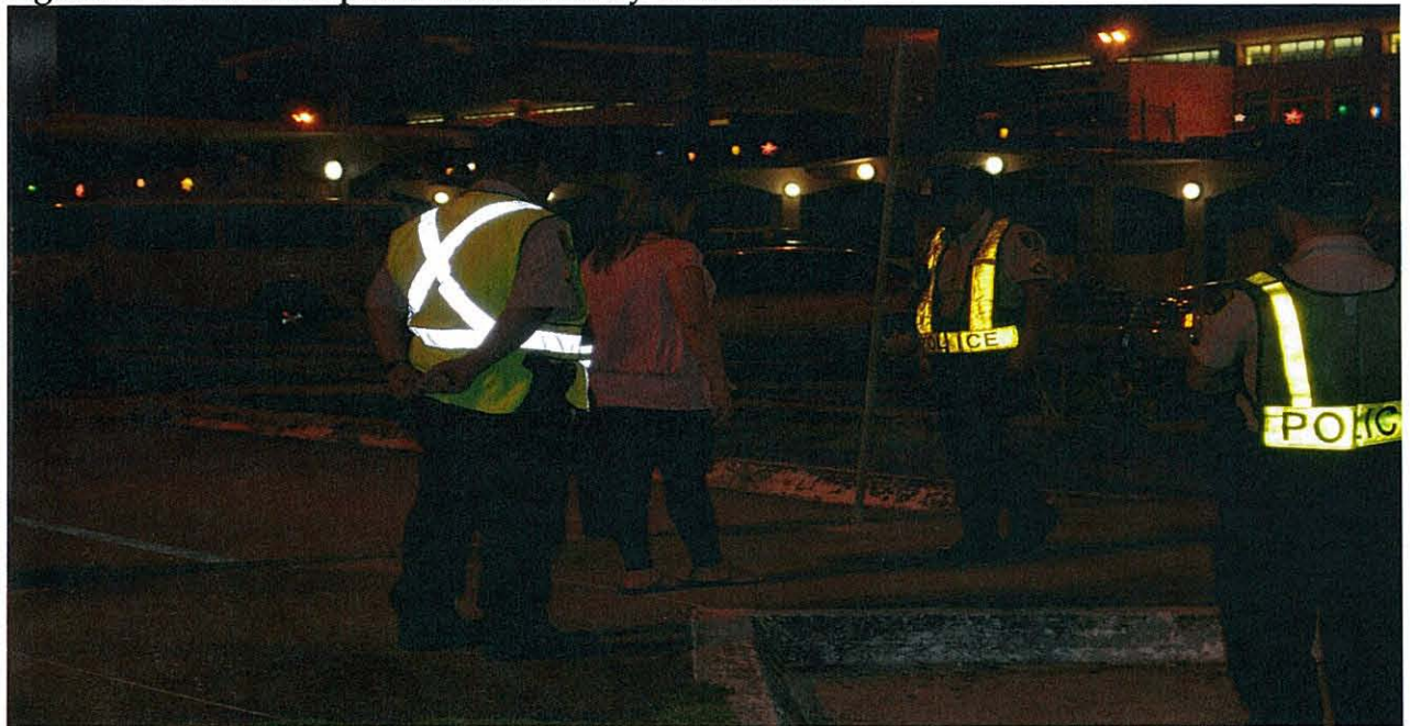
Figure 3: DUI Checkpoint conducted by GIAA-APD.

The Guam Police Department – Highway Patrol Division along with the Guam Airport Police Division participated in the National High Visibility Enforcement (HVE) Mobilizations with the following annual events: