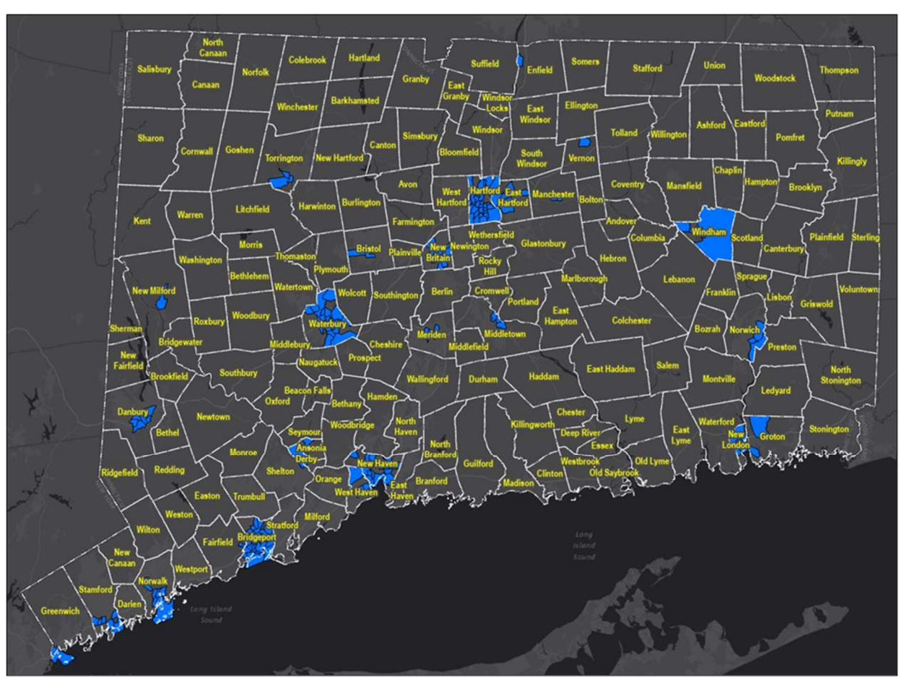
Connecticut Towns and the Justice40 Tracts