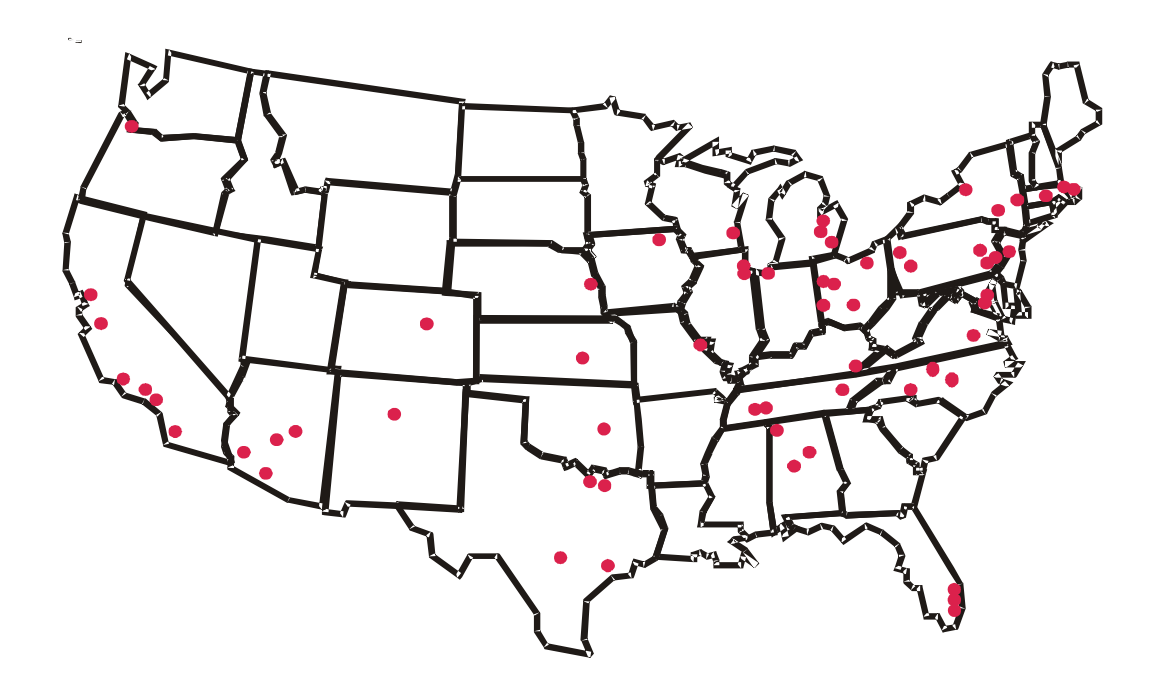
Figure 1. Map of Sixty 2007 National Roadside Survey Sites