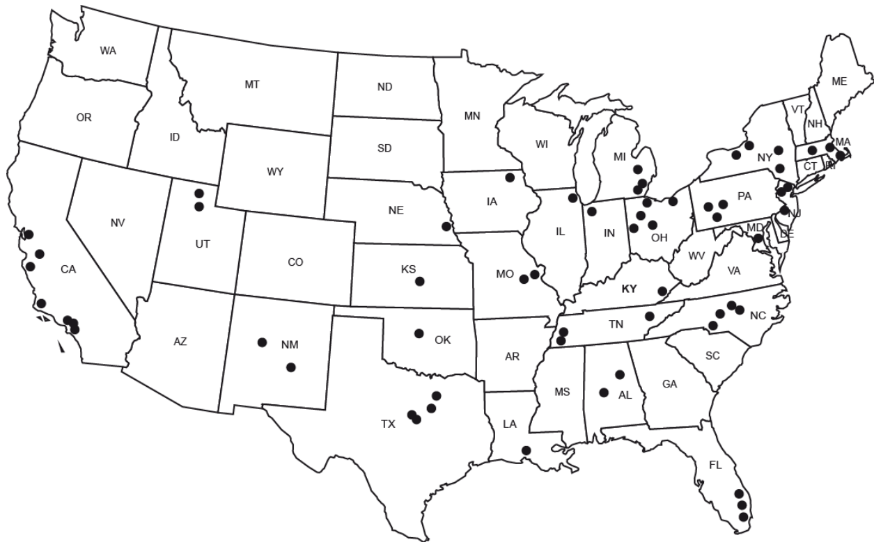
Figure 1. The 2013–2014 NRS Sites

The 60 PSUs used in are shown in Figure 1.