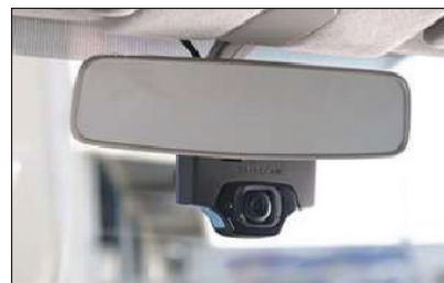
Video event recorder

Both studies began with four weeks of baseline data collection when all teens drove without feedback. This was followed by an intervention phase of four 4-week segments during which participants (teens and parents)