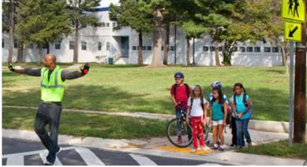
School crossing guards back on the job in school zones.

School year 2013-2014 is just around the corner and motorists are being warned to watch out for children loading and exiting school buses and cars, bicycling and walking to and from school, as well as being reminded to observe cell phone and texting laws in their school districts.