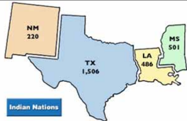
Number of unbuckled teen deaths during 2001 – 2006 in the Region 6 States

Teens have higher fatality and injury rates in motor vehicle crashes than any other age group. One of the most effective measures a teen can take to prevent injury and death in a crash is to wear a seat belt, but the majority of fatally injured teens are not buckled up. While observed seat belt use for teens has risen gradually, the majority of 16- to 20-year-old passenger vehicle occupants killed in car crashes continue to be unrestrained (61 percent in 2007). Past demonstration projects and evaluations of teen belt use indicate that strategies that have been effective in increasing belt use for adults are also the most promising strategies for teens. These include primary laws and highly publicized enforcement of belt laws (such as Click It or Ticket programs).