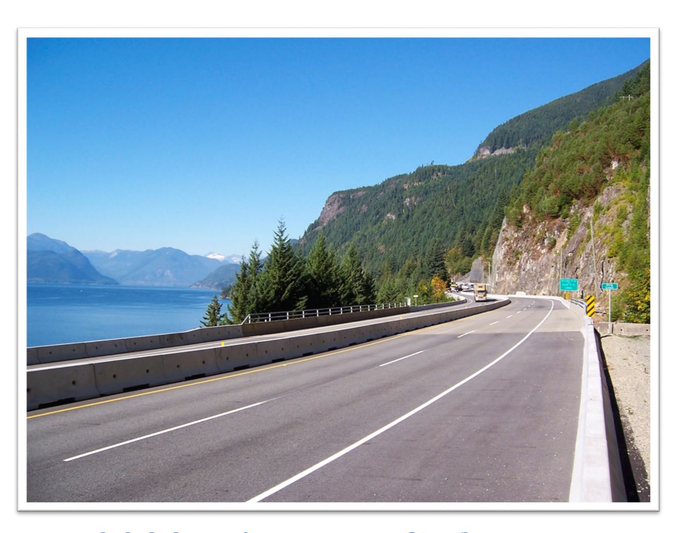
FY 2022 Highway Safety Plan ARKANSAS