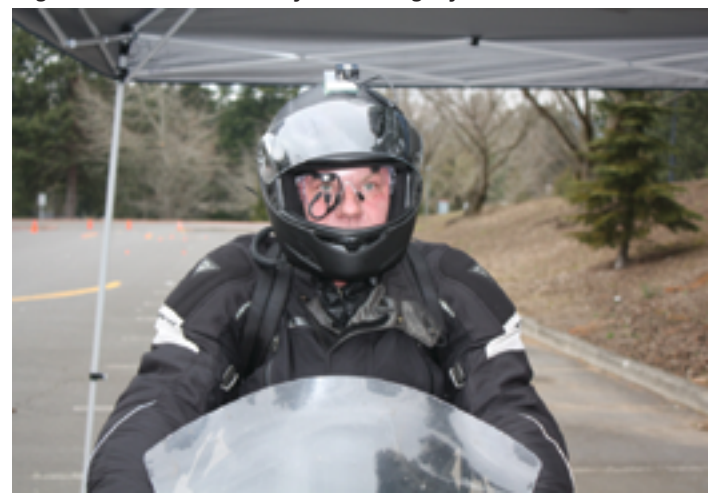
Figure 1. Helmet With Eye Tracking System

Stopping distance was the distance necessary to bring the motorcycle to a complete stop under hard braking. When this ratio fell below 1.0, the distance to stop was greater than the rider's sight distance, meaning that the rider was not looking far enough ahead to stop safely. The magnitude of the visual gaze area was defined as the size of the area the rider scanned, as measured by the x-y coordinate data provided by the eye tracker system.