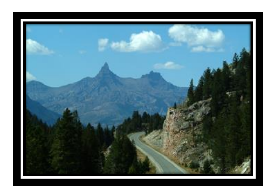
Highway Safety Behavioral Grants Program FY2019 Annual Report – Page | 2

Ultimately, individual driver awareness is the key to preventing crashes. Drivers and passengers should always remember to buckle up, observe posted speed limits and other traffic laws, and never drive when impaired by drugs, alcohol, or fatigue.