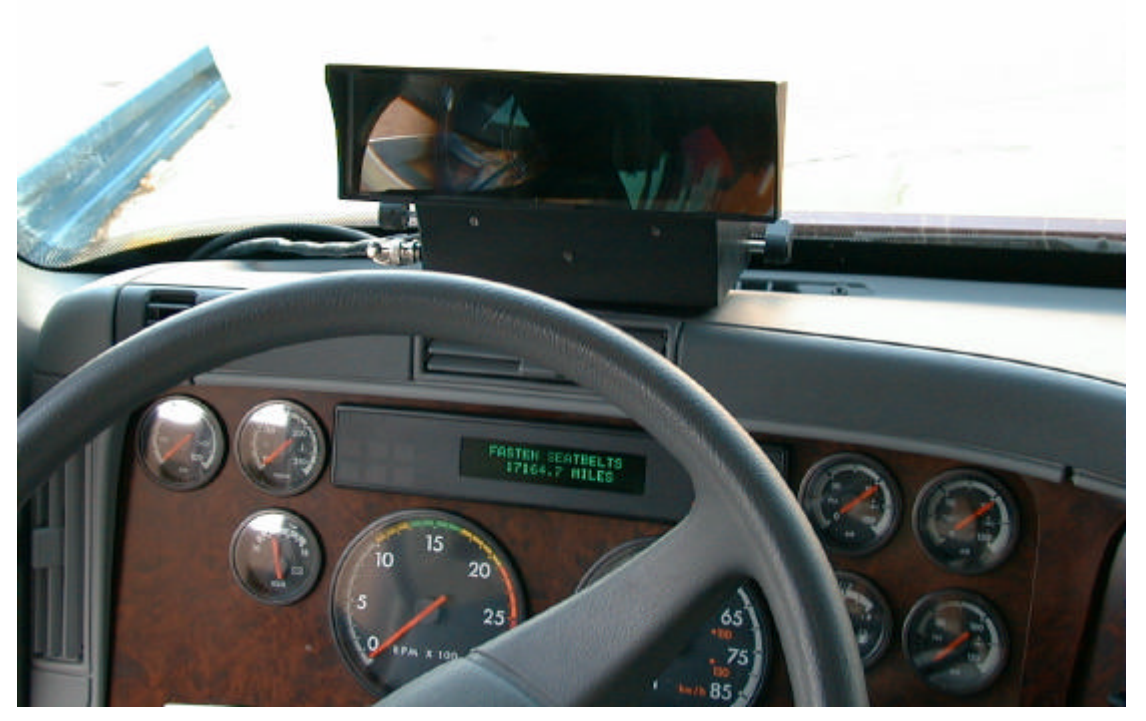
Figure 5. Dash-Mounted Truck HUD