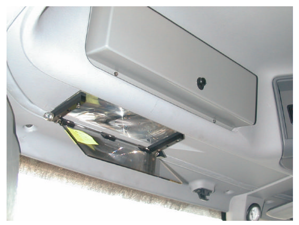
Figure 6. Truck HUD Mounted in Overhead Compartment