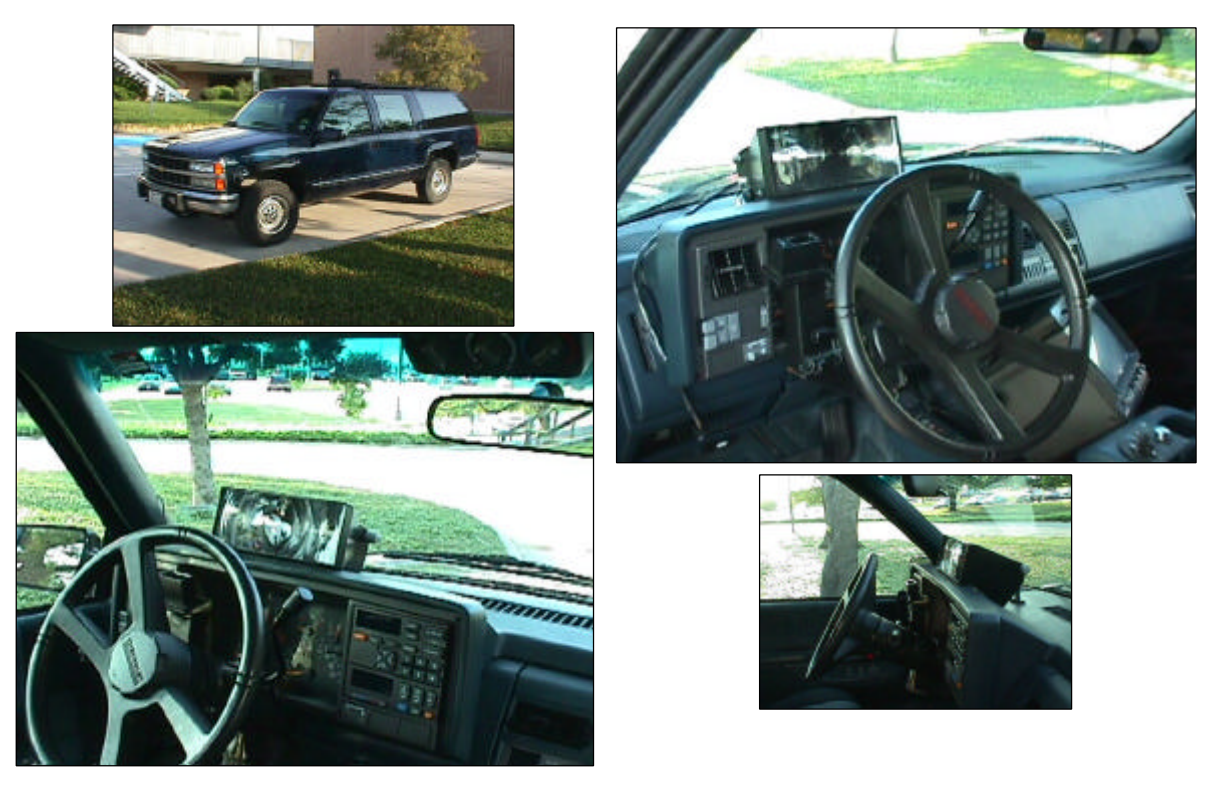
Figure 4. Engineering Prototype HUD Installed in Raytheon Suburban<sup>2</sup>

The successful trade studies and breadboard efforts paved the way for progression into the engineering prototype effort during which Raytheon designed and built a prototype NHTSA HUD and installed it, along with a NightDriver<sup>TM</sup> camera, in a Raytheon-owned Suburban, as shown in Figure 4 . Formal Human Factors testing was not a part of our NHTSA HUD program. However, to gather basic information on the suitability of the improved production realistic HUD for night driving operations, Raytheon conducted informal driving evaluations with our development team and eight or ten other individuals who had no knowledge of the project or the technology. The results indicated that the prototype HUD indeed supports night driving and enhances safety. None of the drivers reported the HUD to be a source of distraction. All of the drivers readily adapted to the HUD and quickly realized and commented on the safety benefits of being able to view the scene "far beyond" their headlights. Typical driver comments are summarized in Section 5.2.1. We reported these test results and provided the program status to NHTSA during the Critical Design Review (CDR) in October 1999. The prototype HUD design goals and measurements of performance are summarized in Table 3 . In December 1999, we conducted a successful driving demonstration of the HUD (in the Suburban) for NHTSA and other agencies invited by NHTSA at a site near Washington, DC.