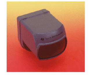
Figure 1. The original prototype NightDriver<sup>TM</sup> camera paved the way for an automotive thermal imaging camera and HUD (NightVision<sup>TM</sup>) production program

The prototype NightDriver<sup>™</sup> camera, pictured in Figure 1 , weighed approximately 2 pounds with a volume of approximately 60 cubic inches. The prototypes provided clear, sharp thermal imagery that facilitated detection of a person at approximately 700 meters. Preliminary design verification testing of the engineering prototypes indicated that the cameras would be reliable and rugged. During October 1996, the NightDriver<sup>™</sup> camera officially debuted publicly at the 1996 Convergence Conference in Detroit, further adding interest from automobile manufacturers. The original prototype cameras were used extensively in demonstrations and trials such as the Baja 1000 race. Further Raytheon NightDriver<sup>™</sup> development, testing, and prototyping followed and a production program was consummated with General Motors for the NightVision<sup>™</sup> system.