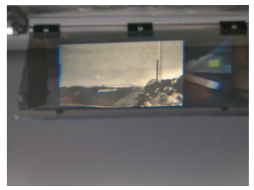
Figure 7. Imagery on Overhead Compartment-Mounted HUD

The Fresnel lens is made from molded acrylic. It is antireflective-coated to reduce glare from outside light sources such as headlights and streetlights. The image that appears in the HUD is designed to be actual size when viewed from a nominal distance of 28 inches.