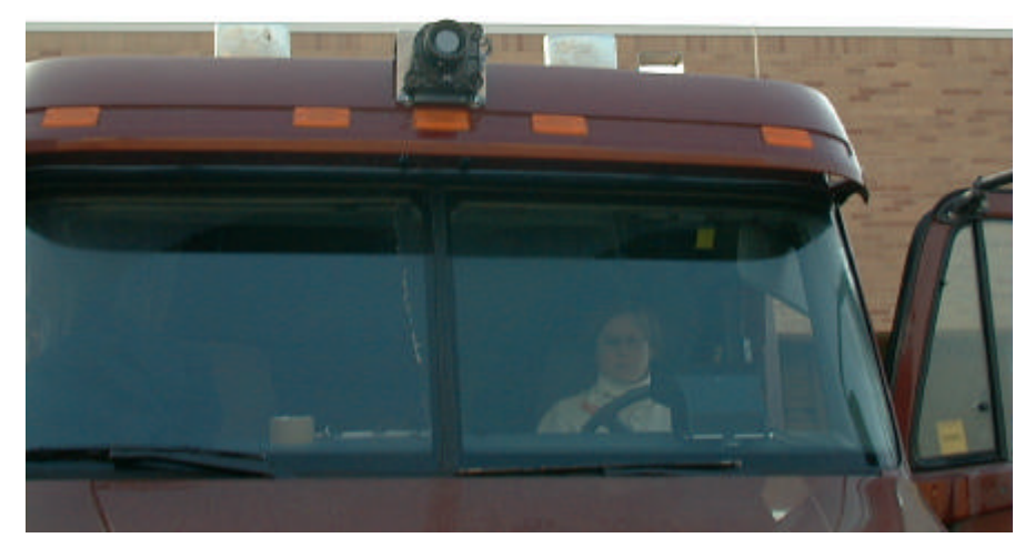
Figure 8. Camera Installed on Truck Airfoil

The infrared camera used is the same as the one to be used in the 2001 Cadillac. We fabricated a bracket to mount to the airfoil above the windshield on the front of the cab and mounted the camera to the bracket using the same adjustable brackets as those used on the Cadillac. Figure 8 is a photograph of the installed camera.