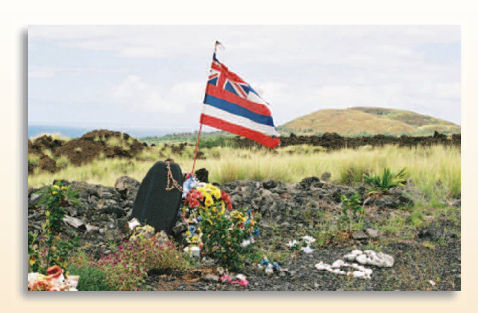
"How many deaths will it take till he knows that too many people have died" Blowing in the Wind, Bob Dylan